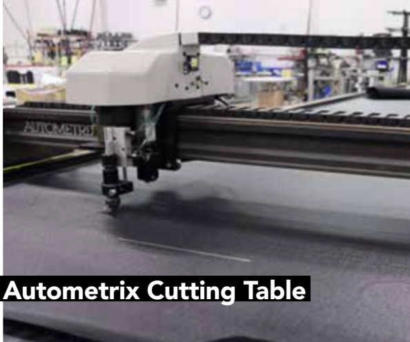
Autometrix Cutting Table