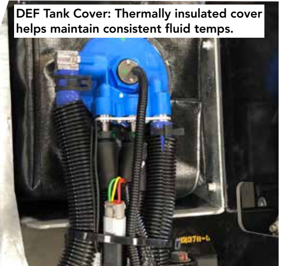
DEF Tank Cover: Thermally insulated cover helps maintain consistent fluid temps.