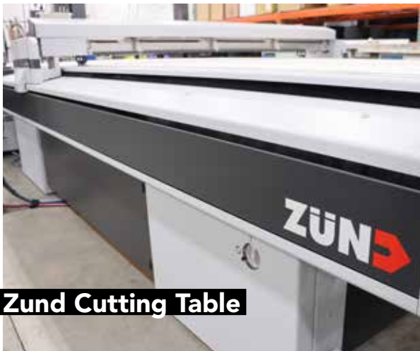
Zund Cutting Table