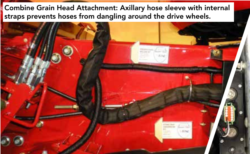
Combine Grain Head Attachment: Axillary hose sleeve with internal straps prevents hoses from dangling around the drive wheels.