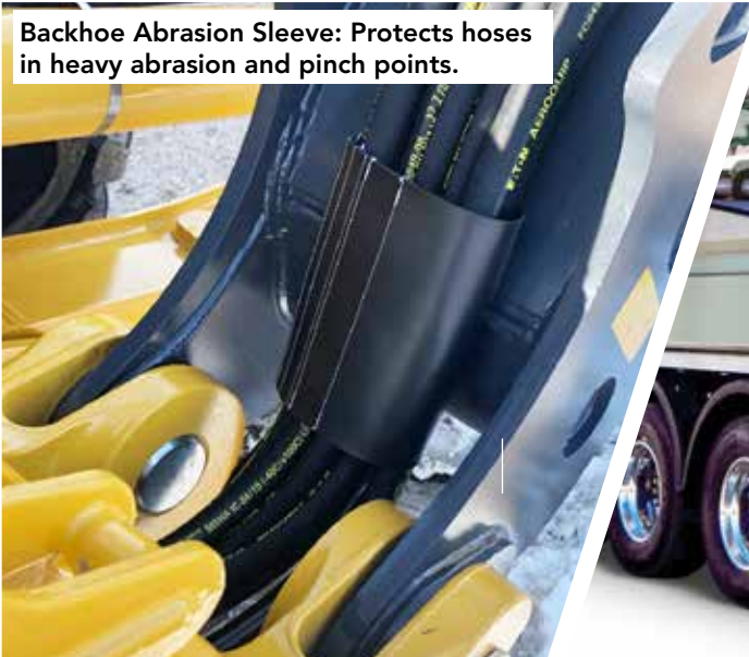
Backhoe Abrasion Sleeve: Protects hoses in heavy abrasion and pinch points.