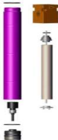
Figure #2: Oil Coalescing Filter