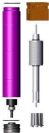
Figure #1: Water Separator